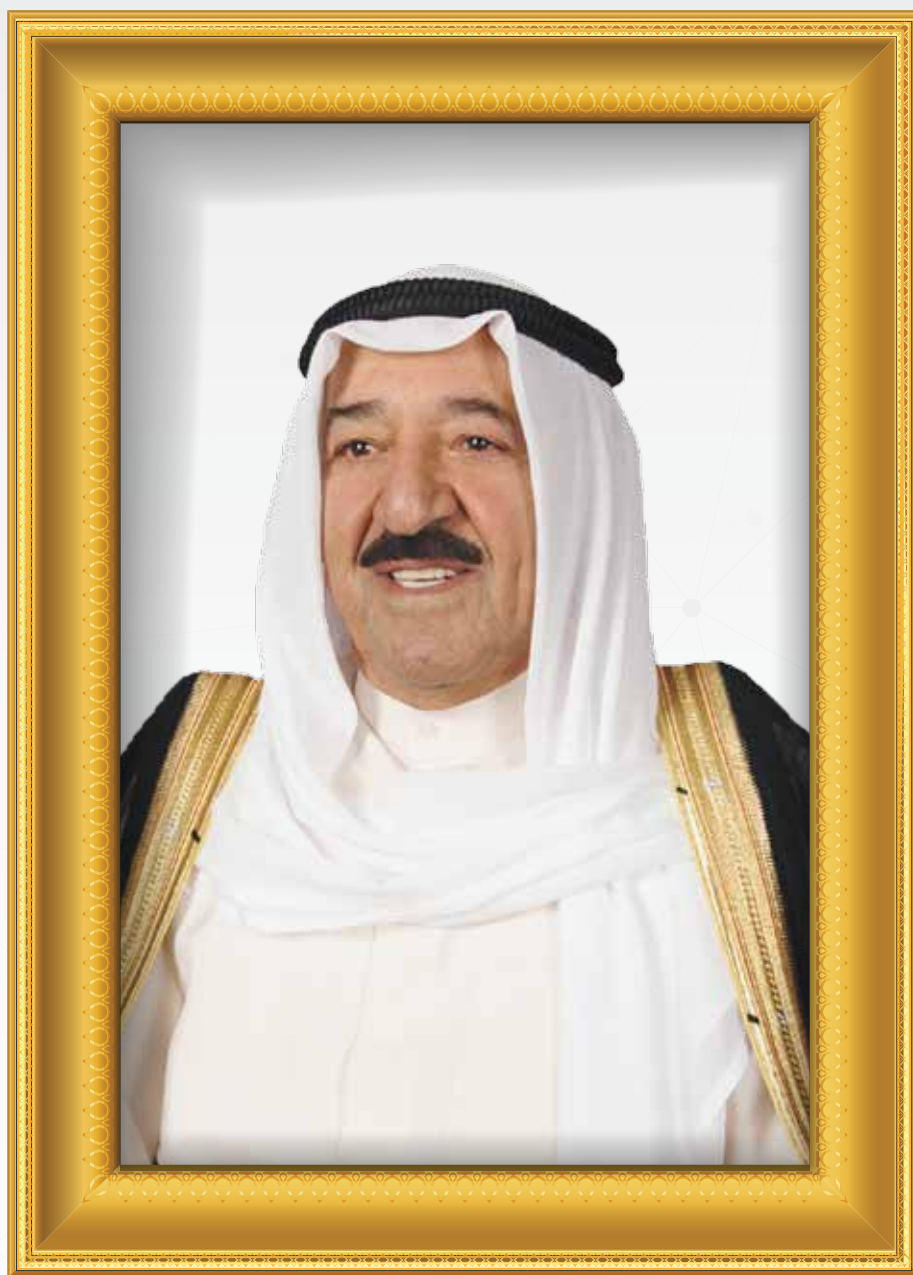
• H.H Sheikh Sabah Al-Ahmad Al-Jaber Al-Sabah • • Amir of the State of Kuwait •