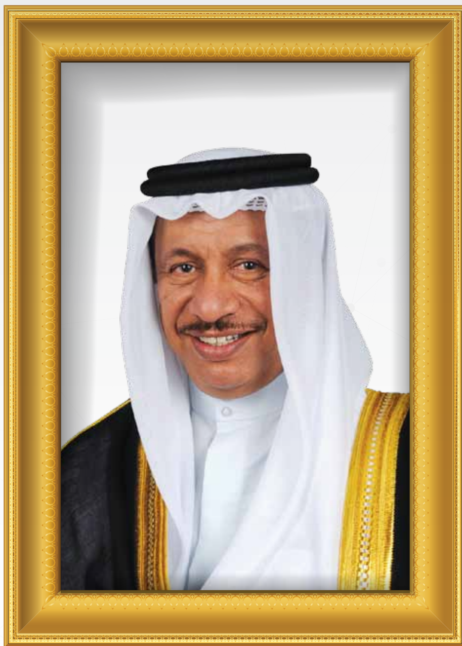
•—————• H.H Sheikh Jaber Al-Mubarak Al-Hamad Al-Sabah Prime Minister •—————•