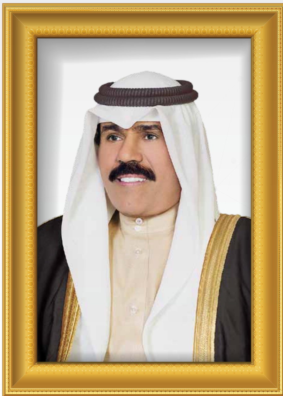
• H.H Sheikh Nawaf Al-Ahmad Al-Jaber Al-Sabah • • Crown Prince of the State of Kuwait •