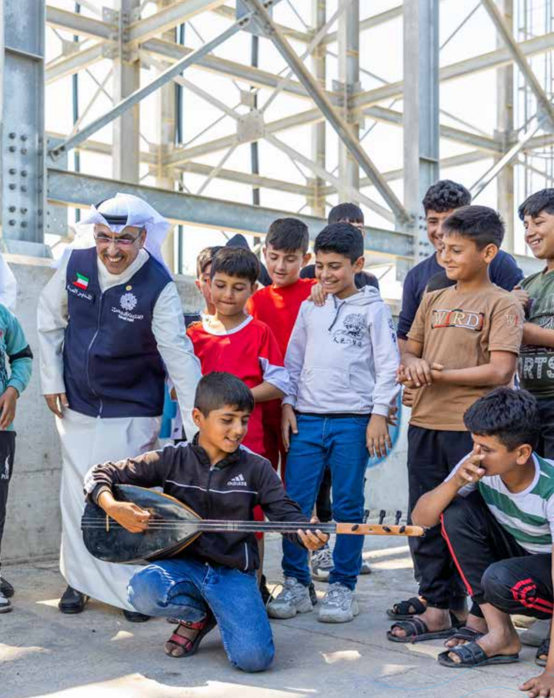
The Rehabilitation of Water Storage and Distribution System Project for the Syrian Refugee Camps - Republic of Iraq