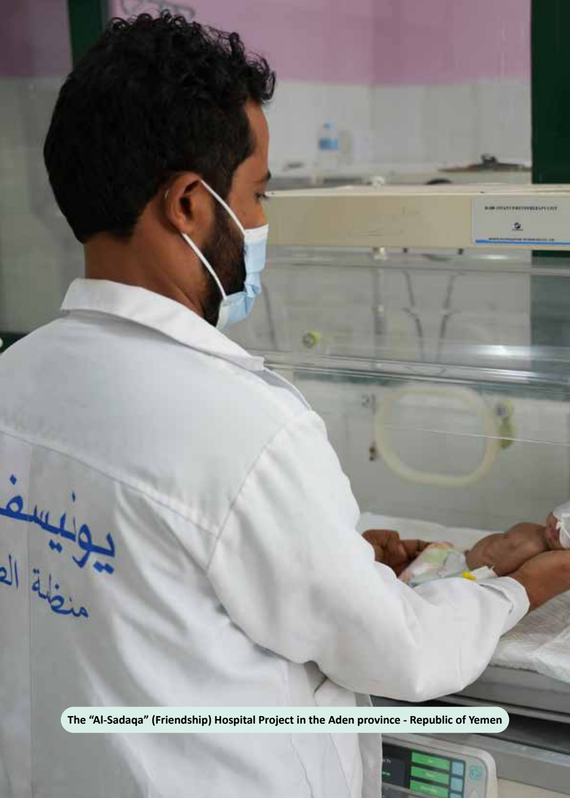
The "Al-Sadaqa" (Friendship) Hospital Project in the Aden province - Republic of Yemen